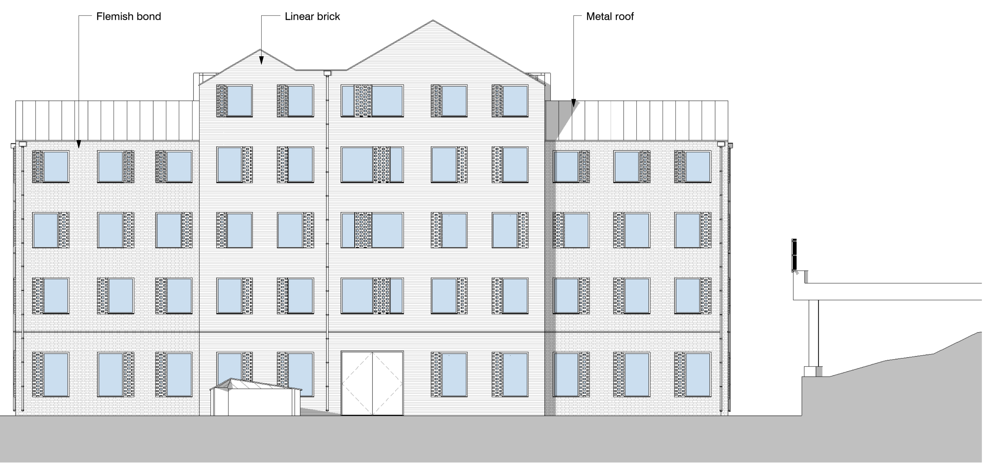
D - West Elevation 1 : 100