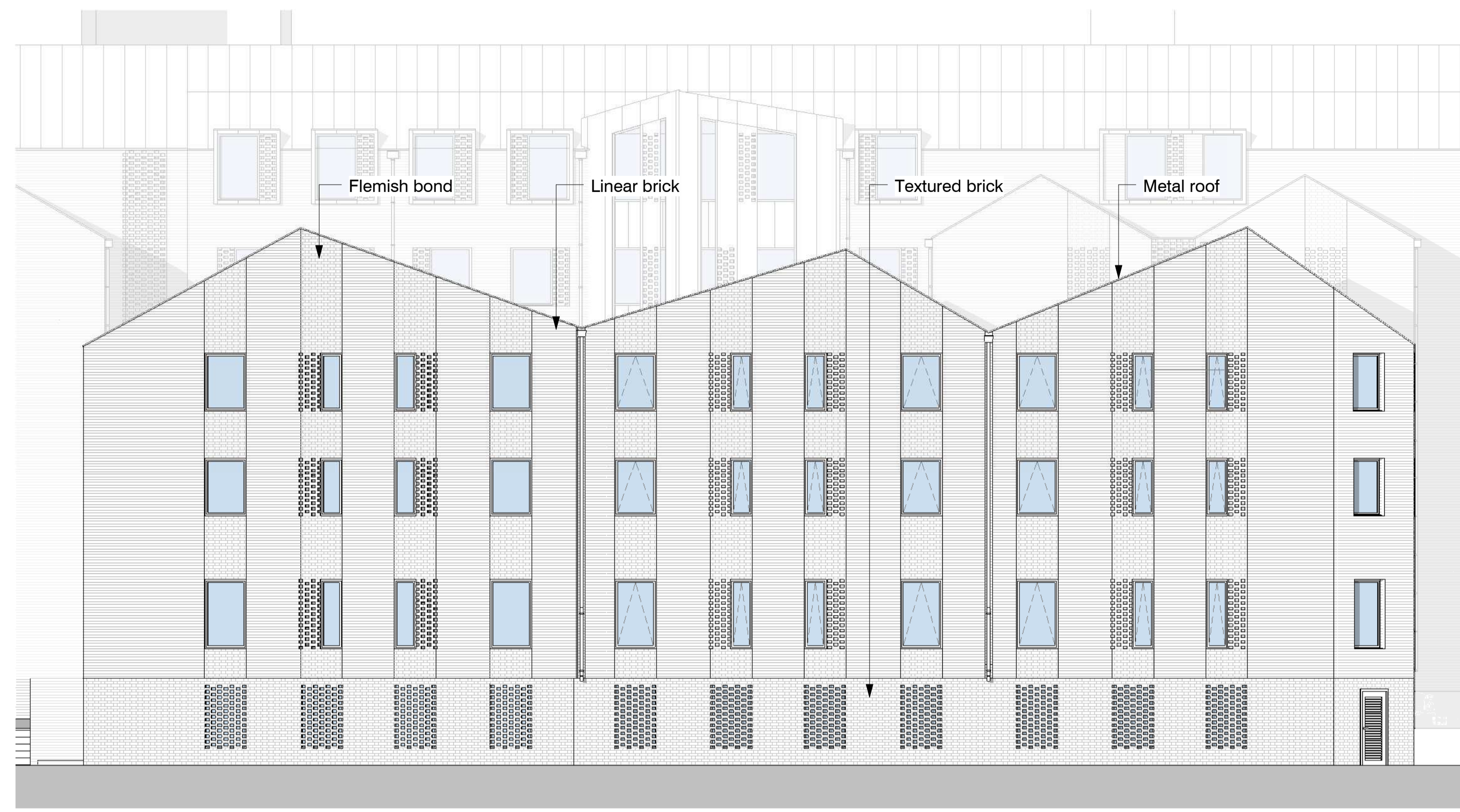
North Elevation - E 1 : 100