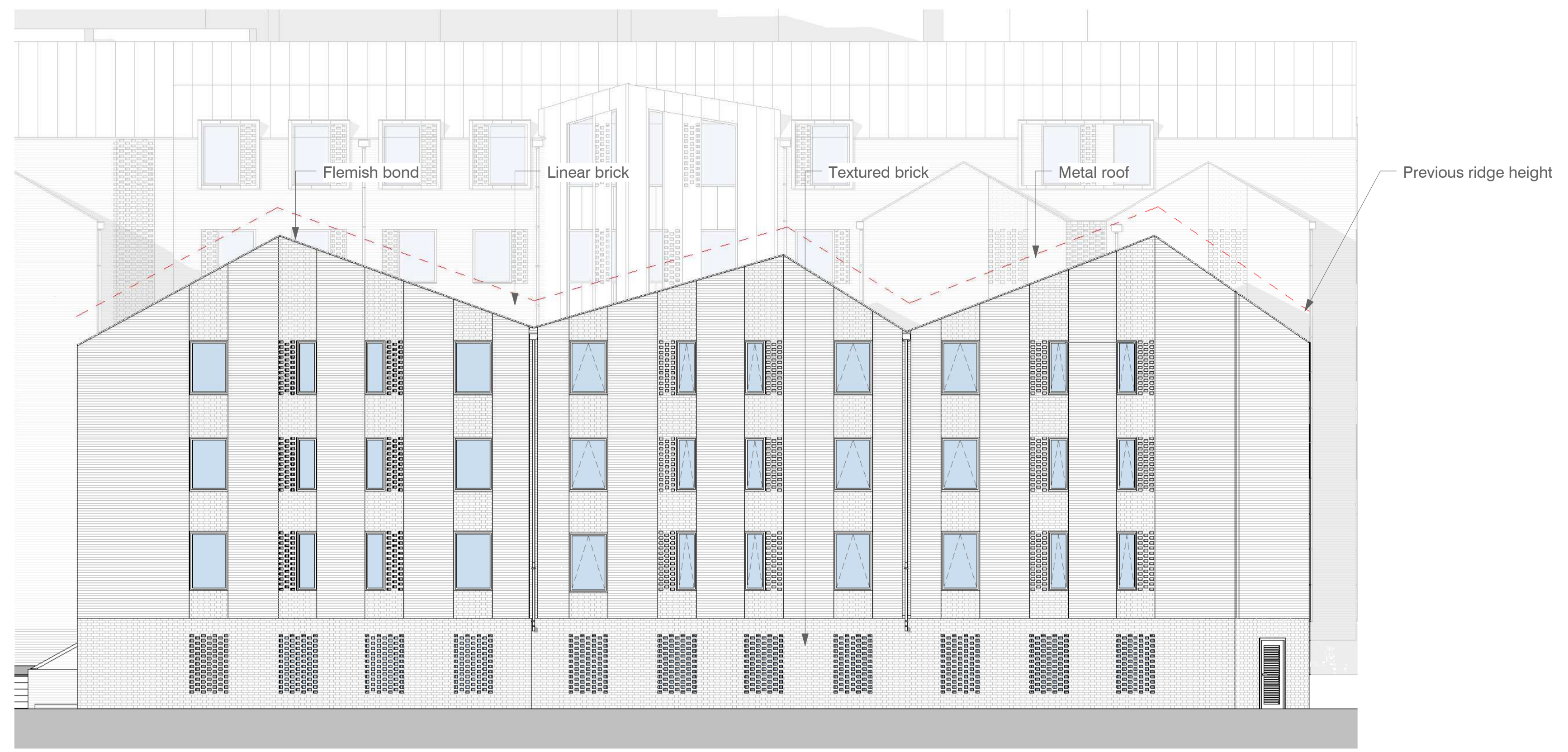
North Elevation - E 1 : 100