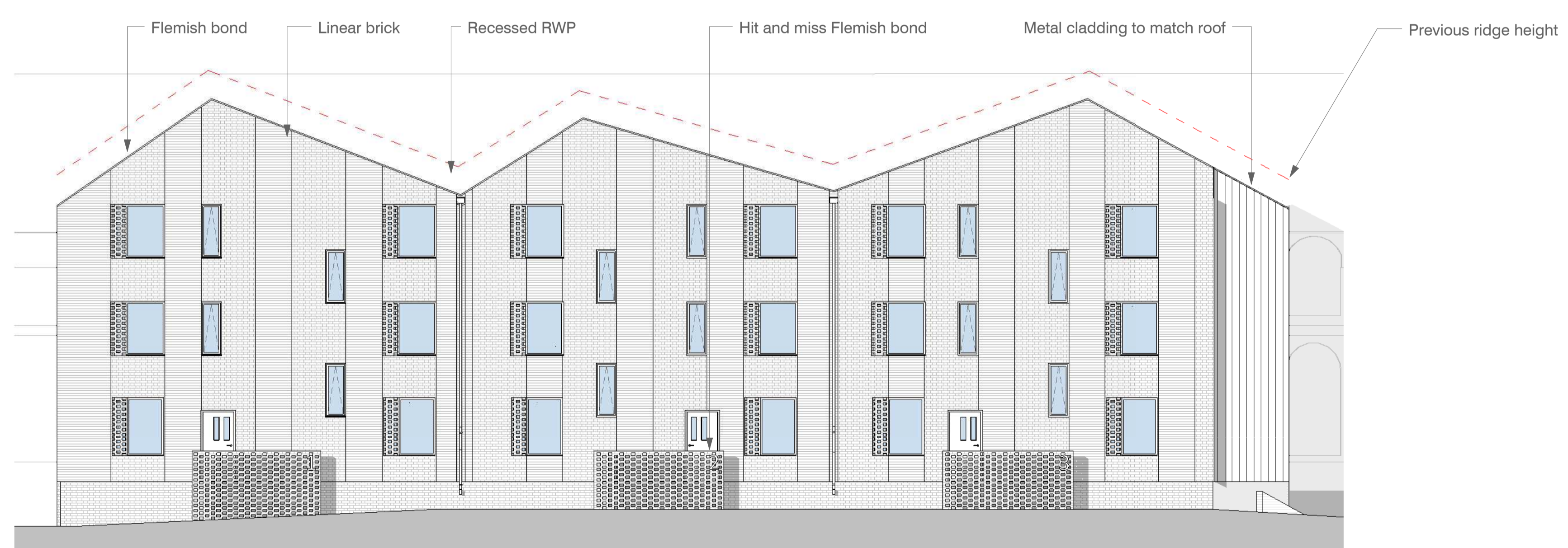
South Elevation - F 1 : 100