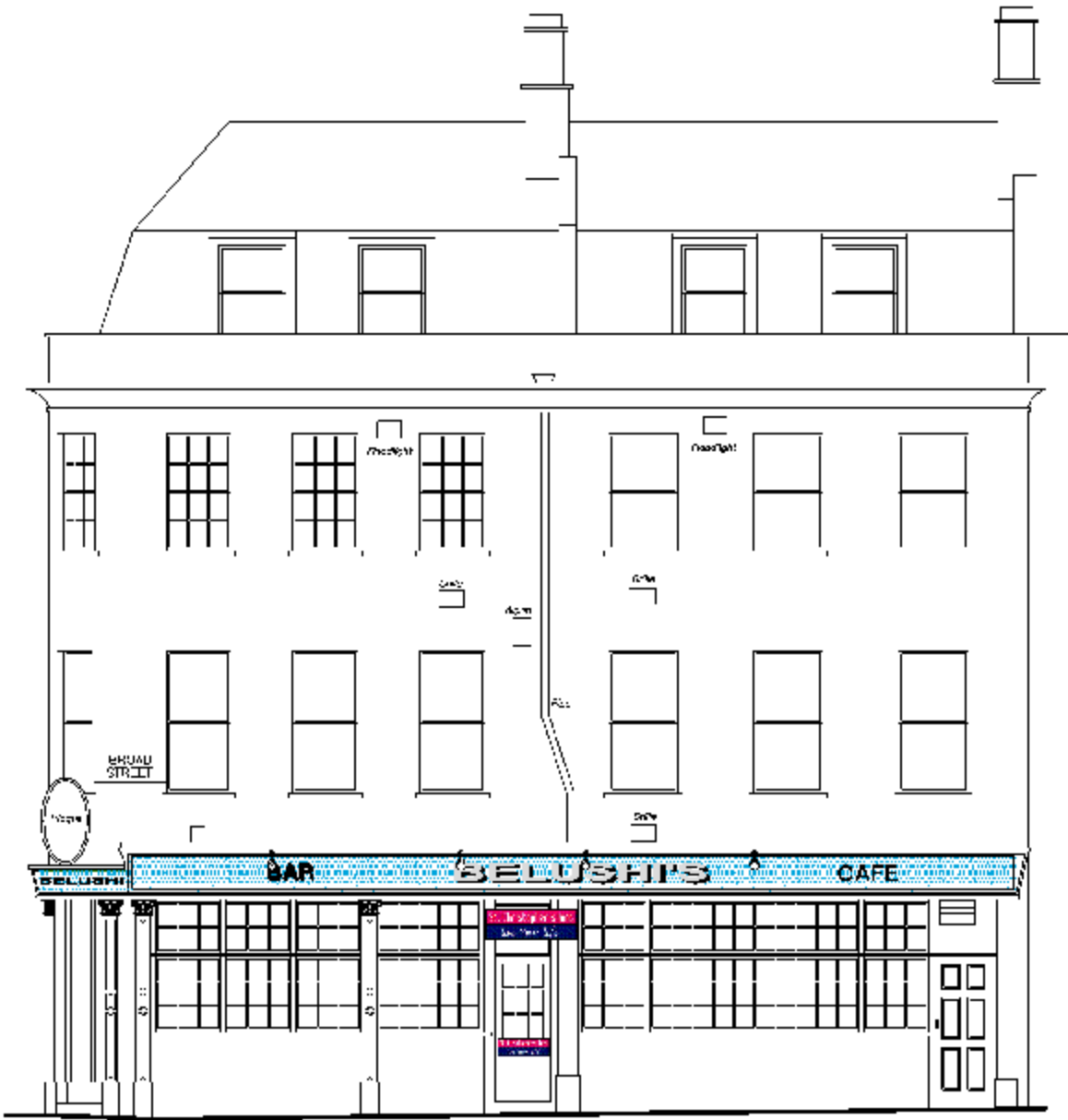
Broad Street Elevation 1:100

1. The Architect shall be responsible for the design and construction of the building and shall ensure that the building is constructed in accordance with the approved plans and specifications. 2. The Architect shall be responsible for the design and construction of the building and shall ensure that the building is constructed in accordance with the approved plans and specifications. 3. The Architect shall be responsible for the design and construction of the building and shall ensure that the building is constructed in accordance with the approved plans and specifications.