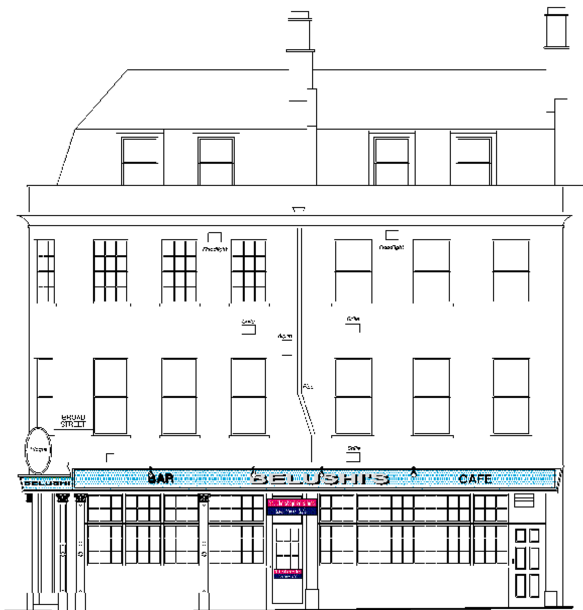
Broad Street Elevation 1:100

1. The Architect shall be responsible for the design and construction of the building and shall ensure that the building is constructed in accordance with the approved plans and specifications. 2. The Architect shall be responsible for the design and construction of the building and shall ensure that the building is constructed in accordance with the approved plans and specifications. 3. The Architect shall be responsible for the design and construction of the building and shall ensure that the building is constructed in accordance with the approved plans and specifications.