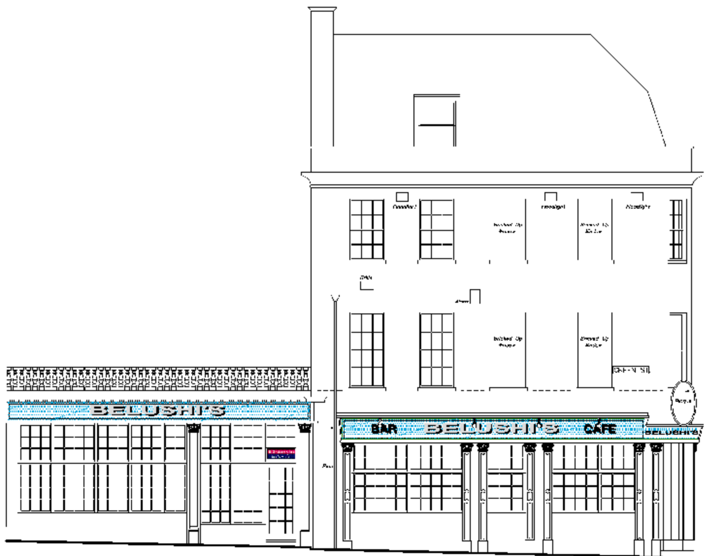
Green Street Elevation 1:100