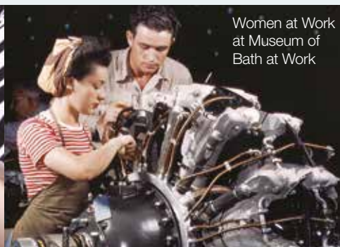
Women at Work at Museum of Bath at Work