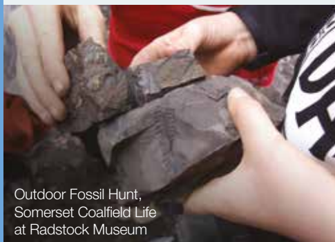
Outdoor Fossil Hunt, Somerset Coalfield Life at Radstock Museum

Museums or activities shown on these pages will be free of charge to residents of Bath and North East Somerset on the dates and times listed. Please bring along a current Discovery Card per person to gain free entry into the museum or activity on the dates listed. Please check details in advance.